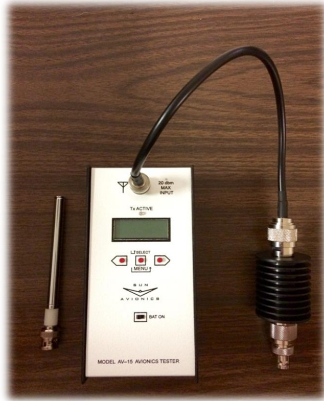
AV-15 With optional 40db RF pad